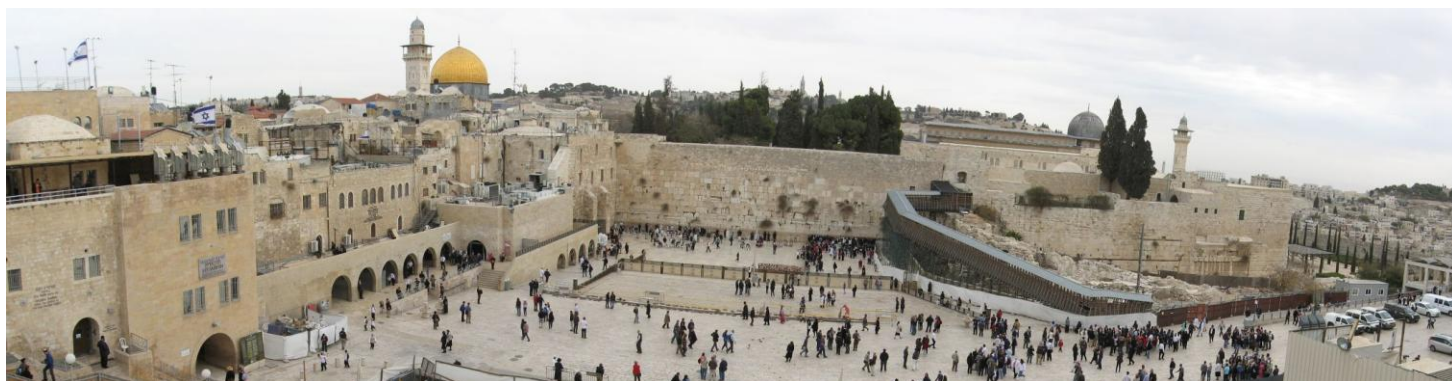
Temple Mount with Dome of the Rock above the Western Wall of The Temple from Yeshua's Time

Tour price does not include beverages not on regular menu; sightseeing or services not specifically mentioned or noted as optional; baggage charges that may be implemented by airlines (none as of this printing).