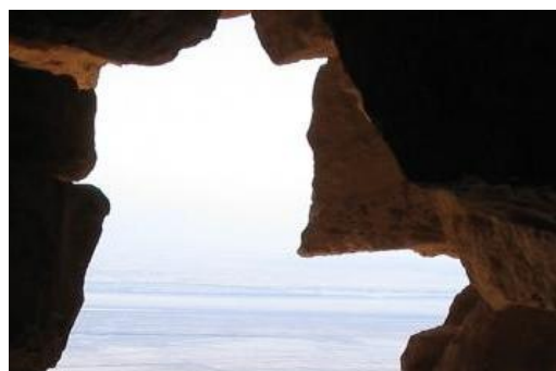
Dead Sea from Scroll Cave