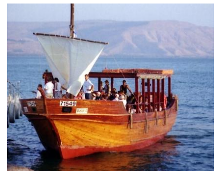
Sailing Sea of Galilee