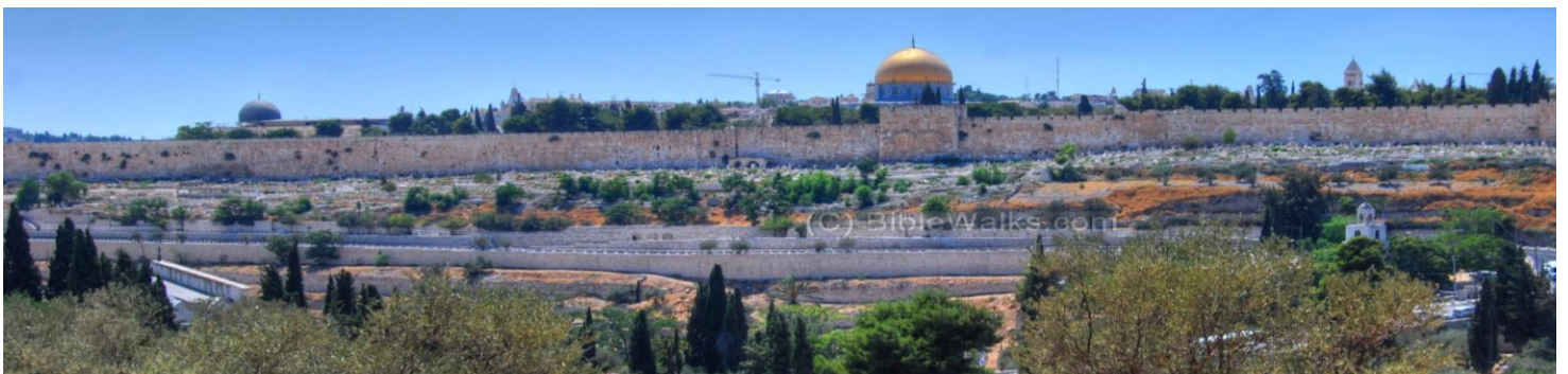
Temple Mount, Jerusalem, from Mt of Olives